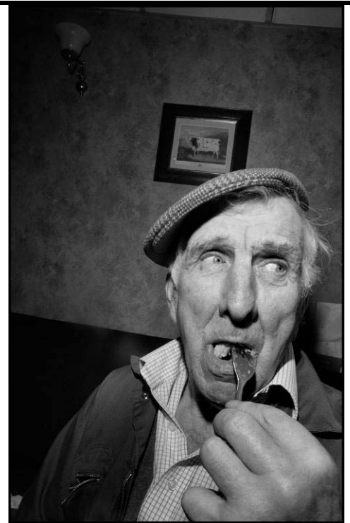
Head On , 2010

4 th March – 3 rd April 2011 Various venues, Derby