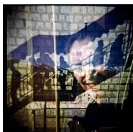
Tehran's Self Portraits © Mehraneh Atashi 2008

Mehraneh Atashi (Iran b. 1980) is an internationally acclaimed artist based in Tehran who has participated in major exhibitions around the world.