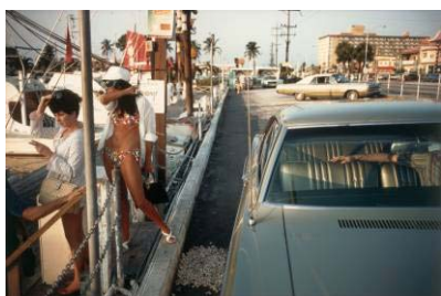
Florida, 1965

The premier exhibition strand also includes Mob FORMAT - an international Mass submission online project in association with Flickr. Submissions will be shown on the BBC Big Screen in Derby Market Place, and on mobile screens around Derby, while a Hype-style gallery in a central pop-up location will print and display the best submissions daily in a constantly-evolving exhibition.