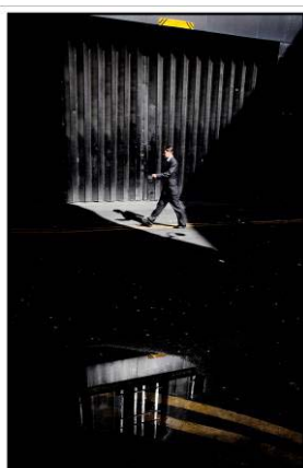
Street B

Impressing judges with the consistency of his vision and execution, Ed Swinden won the first Shoot the Street! Award, run by The British Journal of Photography and FORMAT11.