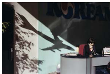
Korean Air

In-Public was set up by Nick Turpin in 2000 to provide a home for Street Photographers, with the aim of promoting street photography and continuing to explore its possibilities.