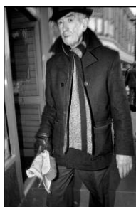
Head On, 2010

Bruce Gilden (USA b. 1946) has been a member of Magnum since 1998, and has won numerous international awards. Over the last forty years his fascination for strong characters and individual peculiarities has brought him up close to his native New Yorkers through to Irish horse racing fans and Japanese mafia gangs. As Gilden explains, "I'm known for taking pictures very close, and the older I get, the closer I get."