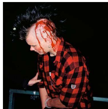
Battered © Harri Pälviranta