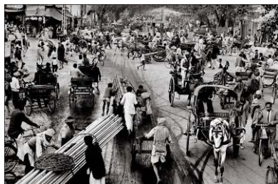
Traffic at Chawri Bazar, Delhi, 1984