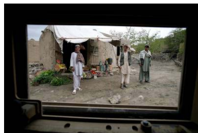
Armoured Tourism © Guilad Khan

Armoured Tourism: Afghanistan through a bullet-proof window is a series of photographs taken through the armoured window of a US military HumVee while on patrols through the highly volatile and mostly Taliban-controlled Logar province.