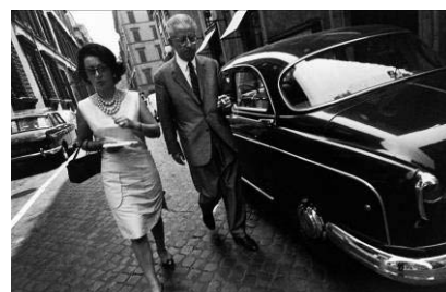
ITALY. Rome. 1964.

The Festival will present work by more than 50 leading new photographers from around the world selected through open submission by a notable panel of leading industry figures. From Iran to China, Afghanistan to USA, Singapore to London, these artists represent the diversity of street photography in practice today and the wide range of subject matter it can address.