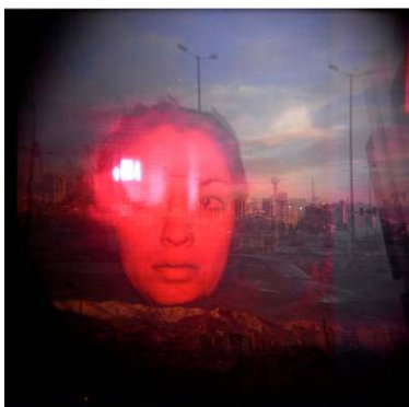
Tehran's Self Portraits