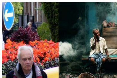
a diptych from the Street Life project