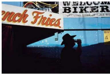
American Color 2

Street photography is an important part of Magnum's heritage. From the early work of founding member Henri Cartier-Bresson to the contemporary colour work of Alex Webb, Magnum's photographers have built longstanding careers on the freedom to document unchallenged.