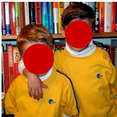
Parental Permissions Denied © Karen Fraser

Parental Permissions Denied is a series of large-scale prints showing photographic downloads of children with siblings, friends or pets. The face of each child is obscured by a red dot. Using the photographic framework of family snapshots, the work explores the current anxiety collectively felt around image copyright and consensual photographic practice.