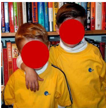
Parental Permissions Denied