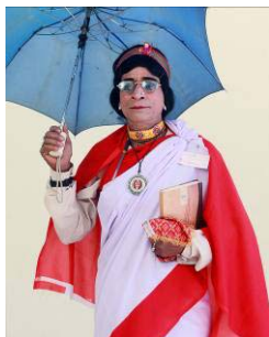
Pratibimb © Vidisha Saini

Vidisha Saini's Pratibimb presents portraits of 'Behrupiyas', a cluster of lower caste communities in India who are nomadic in tradition. Under the patronage of a monarch they provided their services as messengers to another kingdom; today, they perform on streets, and collect alms door to door. Their characters are mostly inspired by popular culture, history, religion and politics, drawing on the visual culture of India.